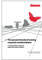
The Success Formula of Winning Corporate Transformations